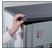
ABS plastic top cover