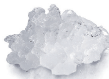
Residual water contents 25%

Ice in its most natural form, made at a temperature just below zero degrees Celsius, contains 25% residual water content, making it very moist. Its flake shape makes it extremely versatile and very simple to use effectively.