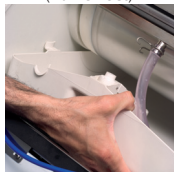
Easy to remove water sump