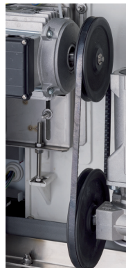
Pulleys & belt system allows to modify ice thickness