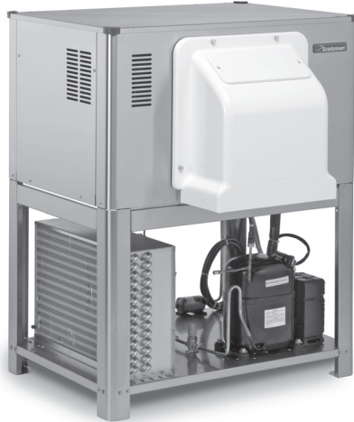
ABS Ice Chute Cover: sold separately.