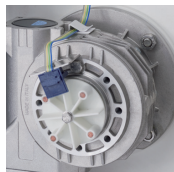
Gear box protection (hall effect)