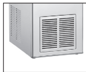
SS AISI 304