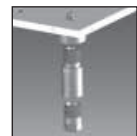
Available as optional KITLEGSEXT000