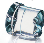
Ø 29 x H 34 mm