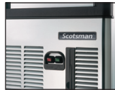
Front ON-OFF Switch Storage bin antibacterial pouch & holder